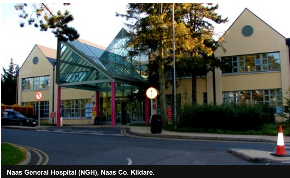
Naas General Hospital (NGH), Naas Co. Kildare.