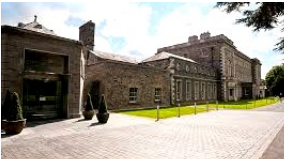
Carton House & Spa, Maynooth , Co Kildare.